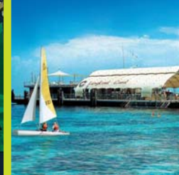
Pulau Payar Marine Park