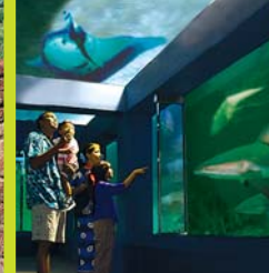
Underwater World Langkawi