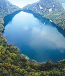
Tasik Dayang Bunting