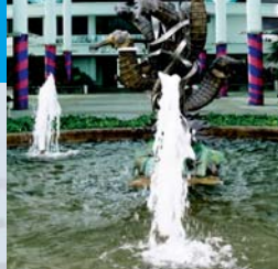
Labuan International Sea Sports Complex