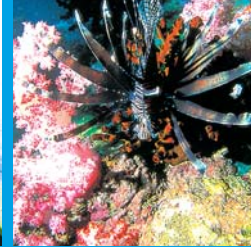
Labuan Marine Museum