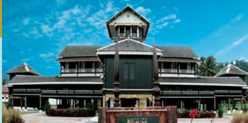
Sri Menanti Royal Museum