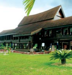
House of Pendita Za'ba