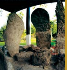
Pengkalan Kempas Historical Complex