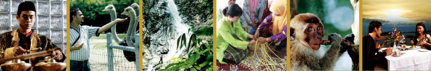
Cultural Handicraft Complex Ostrich Farm Lata Kijang Waterfall Experience the Local Lifestyle Sights of Ulu Bendul Recreational Forest A Romantic Beach Holiday