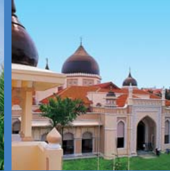
Kapitan Keling Mosque