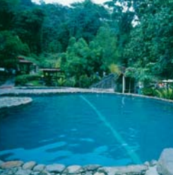
Poring Hot Springs