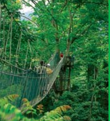
Danum Valley Conservation Area