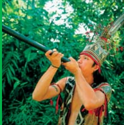
An Ethnic Warrior