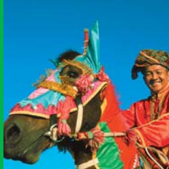
A Bajau Horseman