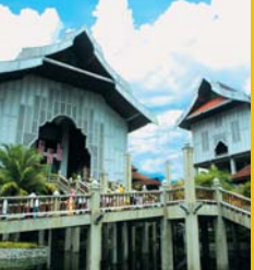
Terengganu State Museum Complex