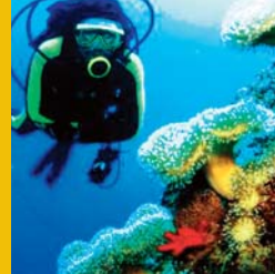
Diving at Pulau Tenggol