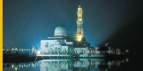
Tengku Tengah Zaharah Mosque